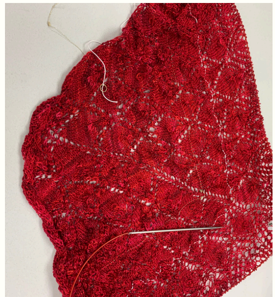
Earlene's red lace shawl