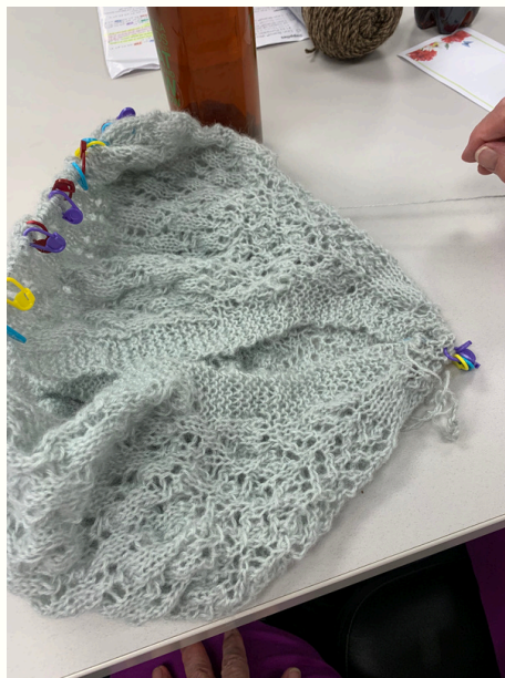
Pat's lace shawl