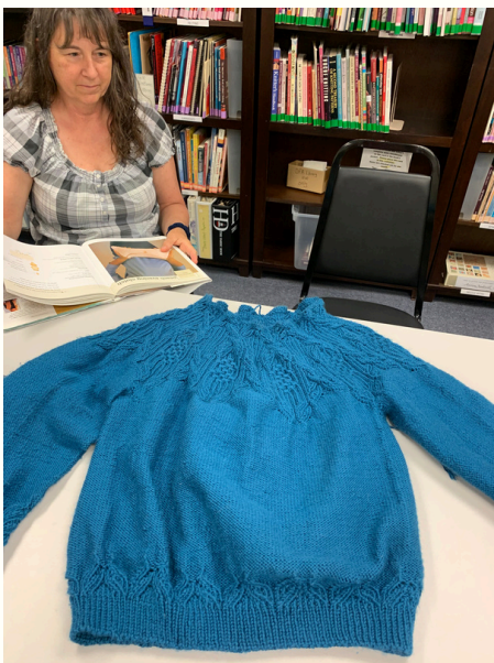
Hope's pretty blue sweater